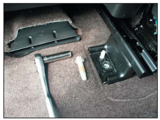
Remove OEM trim panel covering rear inner seat bolts on driver and passenger sides. Remove seat bolt studs. 11 mm socket required.